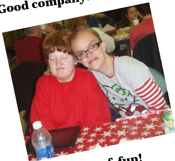
Lots of fun!